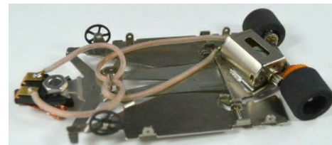
JK 2301W single pan chassis